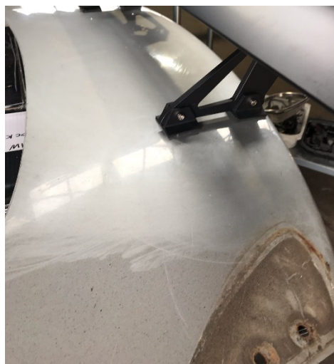
Rear Wing Placement