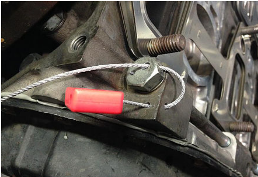
Holes to be drilled for engine seal