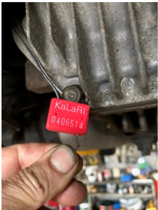
Bolts to be drilled for Diff seal