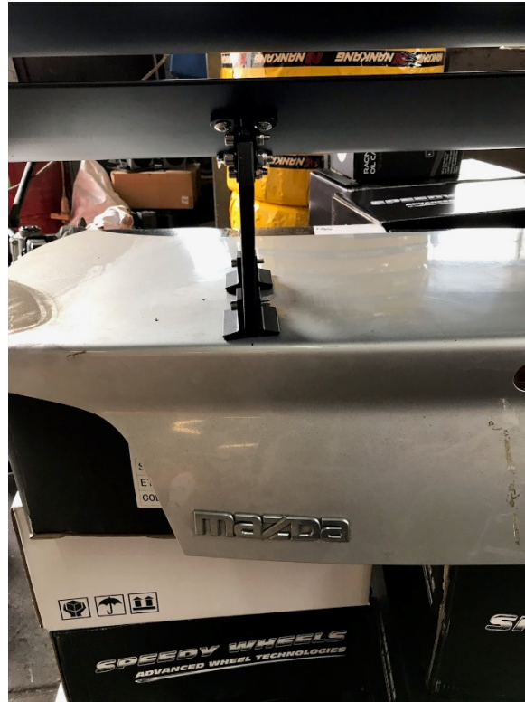
Rear Wing Placement